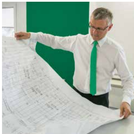
Sales engineers at WAGNER assist in the development of new, marketable and modular fire protection solutions.

WAGNER has sales engineers working in the office as well as in the field. We are looking for colleagues who have a passion for system construction and a technical education in a field such as electrical engineering, mechatronics, mechanical engineering, systems mechanics, software development, process technology, industrial engineering or heating/air conditioning/ventilation technology. A professionally well-versed demeanour and a conscientious work style are just as important as partner-like yet analytical handling of customers and their needs. Look forward to a technically challenging field of activity.